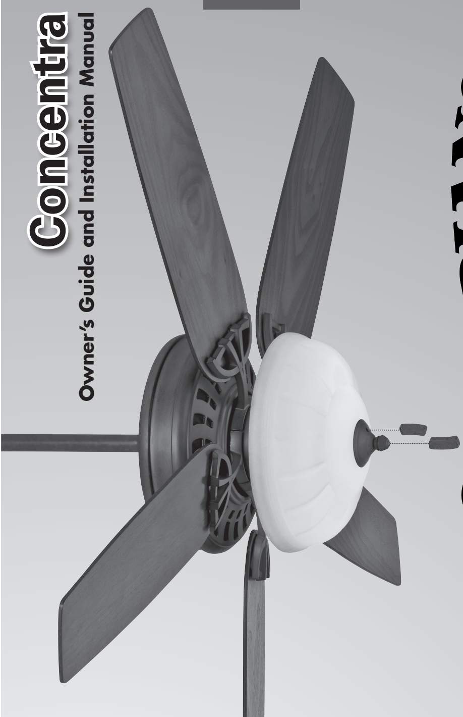
Owner's Guide and Installation Manual